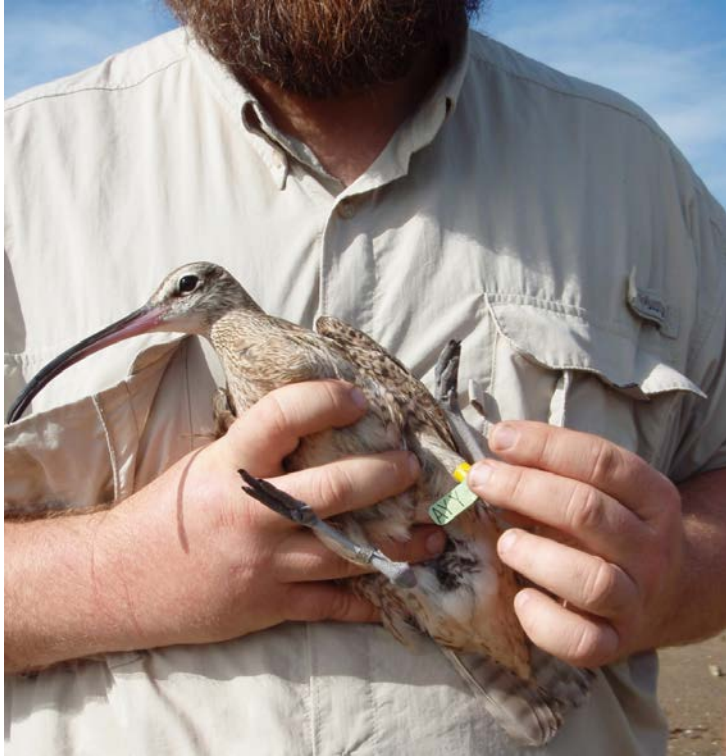
Hope in Hand – Hope in hand before release in Great Pond showing coded flag “AYY”.