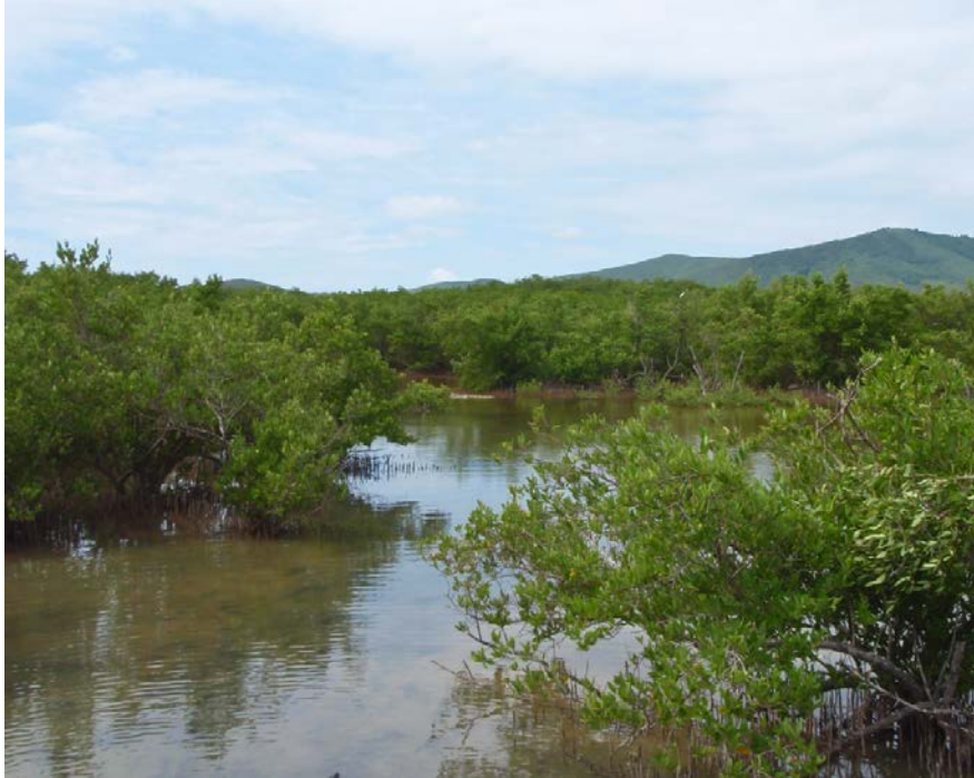
Great Pond – Hope’s winter range on St. Croix is a mangrove wetland and a designated Important Bird Area.